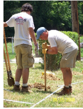
Habitat Trip 08