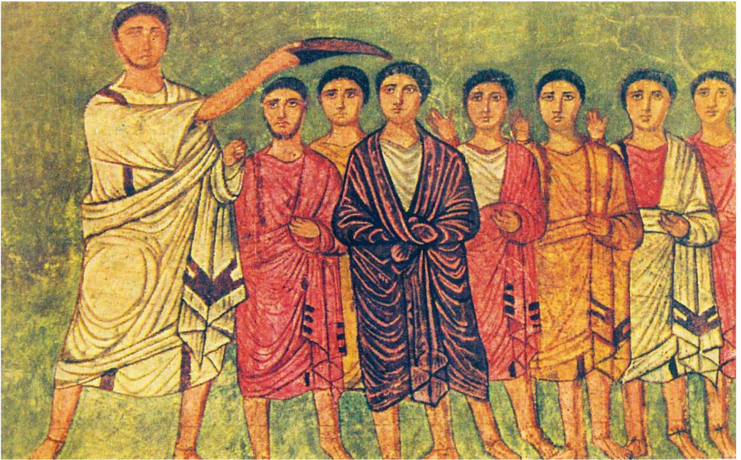
Samuel Anointing David, Dura-Europos Synagogue, Syria, ca. 250 C.E.